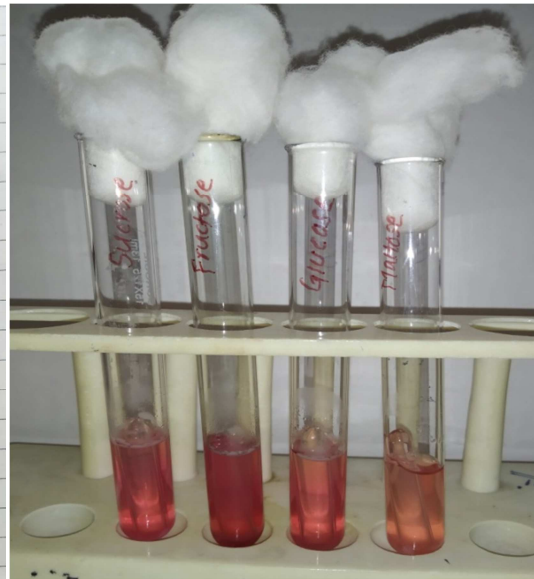
Fig.2 Sugar Test